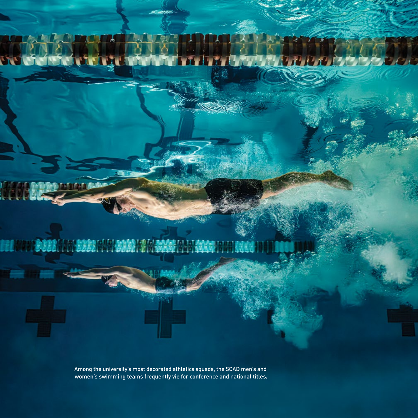
Among the university’s most decorated athletics squads, the SCAD men’s and women’s swimming teams frequently vie for conference and national titles.

Guided by expert coaches and accomplished faculty, these talented teammates demonstrate the SCAD ideals of scholarship, leadership, integrity, and sportsmanship. From a championship-caliber athletics program to a vast array of intramural sports and energizing fitness classes, SCAD helps students stay active outside of the classroom to boost their creativity in the classroom. This commitment is embodied through SCADfit, the premier fitness centers in Atlanta, Savannah, and Lacoste, and ClubSCAD in Savannah. More than 1,000 students of all levels and abilities join teams in badminton, basketball, dodgeball, eSports, flag football, kickball, soccer, Spikeball, volleyball, and more. Join our team at scad.edu/athletics .